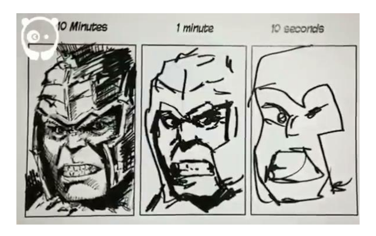
From Tips & Tricks

Click <u>here</u> if video does not play