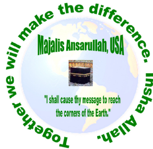
Runner Up 1