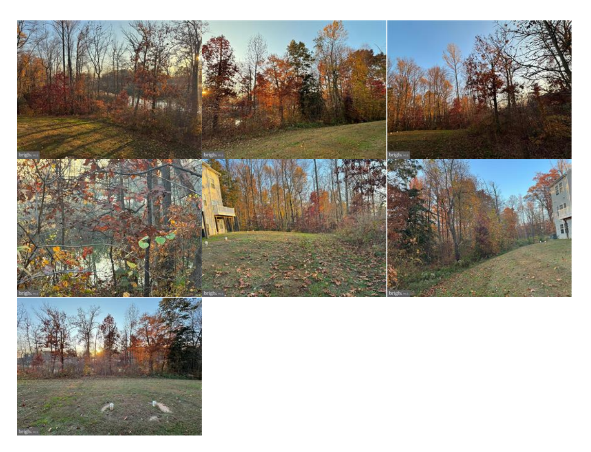
© BRIGHT MLS - Content is reliable but not guaranteed and should be independently verified (e.g., measurements may not be exact; visuals may be modified; school boundaries should be confirmed by school/district). Any offer of compensation is for MLS subscribers subject to Bright MLS policies and applicable agreements with other MLSs. Copyright 2023. Created: 11/16/2023 10:27 AM